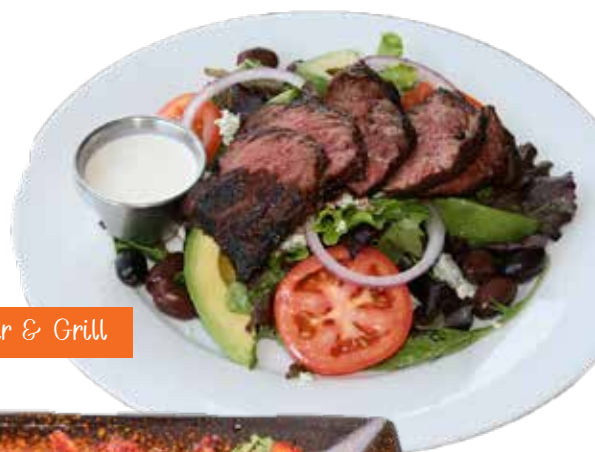
Abbotts Bar & Grill