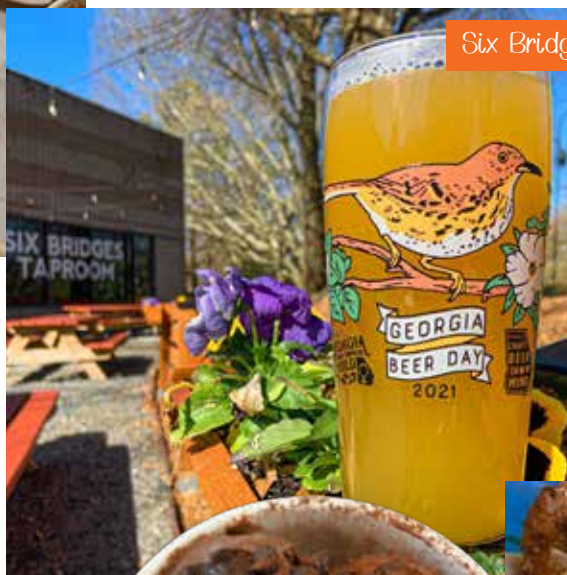
Six Bridges Brewing

Korean BBQ, Indian, Mexican, Italian, or good ole fashioned southern cooking to name a few. Casual to fine dining. You'll never go hungry in Johns Creek!