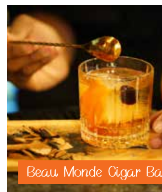
Beau Monde Cigar Bar