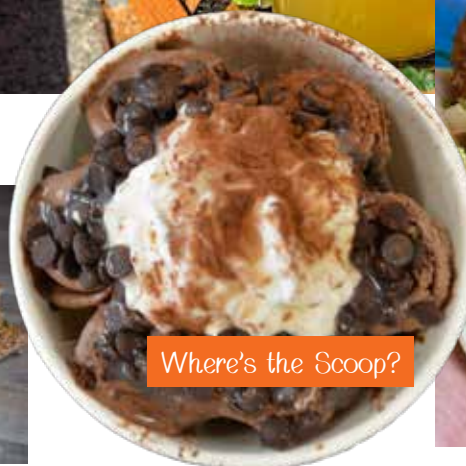
Where's the Scoop?