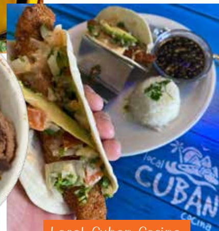
Local Cuban Cocina